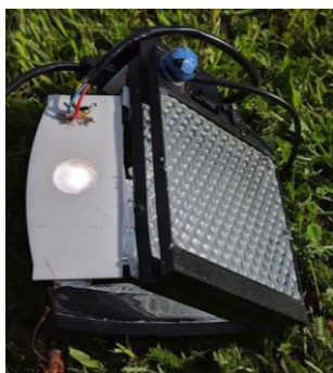
Figure 3: Functional small prototype with automatic tracking.

The optical system was simulated and optimized using Zemax OpticStudio, and a functional 1:15 scale prototype has been constructed. The prototype demonstrates a promising total optical efficiency of \approx 25\% (beam steering lens array efficiency \approx 60\% , reflector efficiency \approx 50\% , focusing error efficiency: \approx 80\% ). Total optical efficiency is expected to increase to 50%-60% using improved manufacturing methods. The lens array is expected to be compatible with injection molding, enabling low-cost high-volume production. By enabling low-cost automatic tracking, this technology may facilitate inexpensive, maintainable and user-friendly solar cooking, fostering its increased adoption across the world.